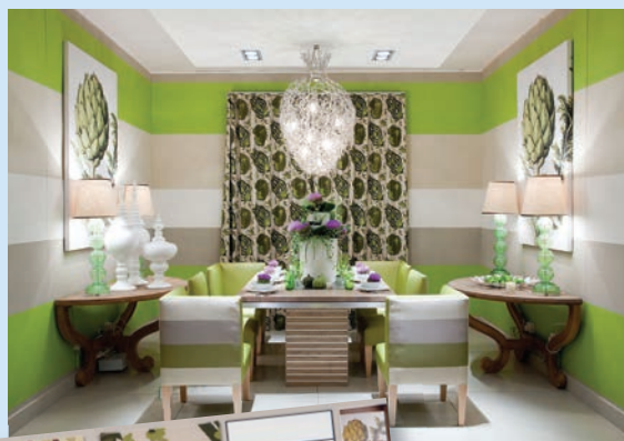
Last year's dining room created by Malcolm Duffin Design & Decoration