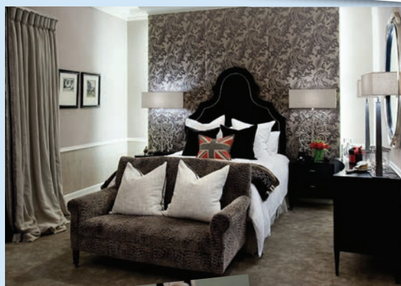
Jeffreys Interiors designed the master bedroom last year. This year they work their magic on the hallway